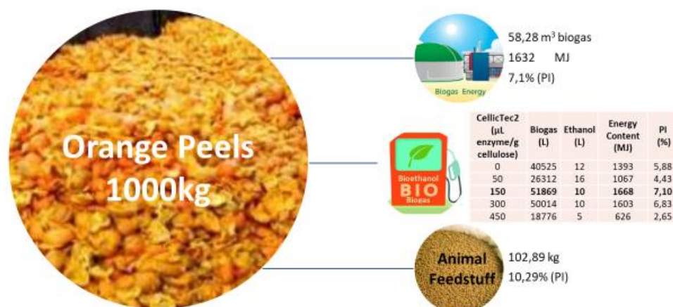
Figure 2. Alternative valorisation routes of orange peels.

Figure 2 summarizes the alternative valorisation routes of 1000kg orange peels waste feedstock. Apart from the products on mass basis, their energy content is also presented. Additionally, the products index (PI) is calculated as the input to products efficiency in terms of mass.